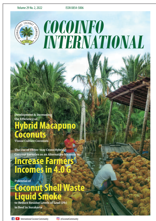
World Coconut Day Competition