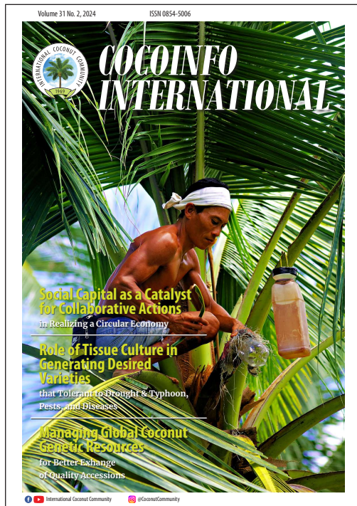
Photo by: Mark Linel Padecio (Philippines), 1 st Winner of the World Coconut Day Competition